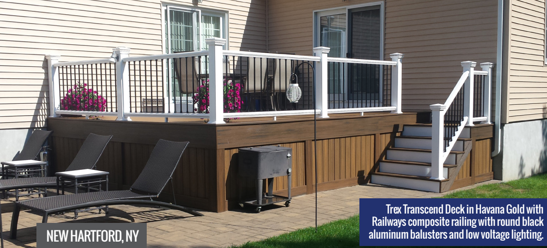
NEW HARTFORD, NY

Trex Transcend Deck in Havana Gold with Railways composite railing with round black aluminum balusters and low voltage lighting.